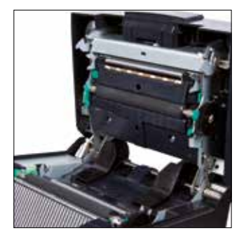
Easy external paper loading with the optional paper roll holder which reduces media loading downtime.